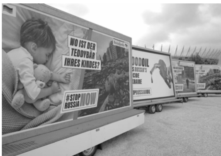
Fig. 2. Prime Minister Mateusz Morawiecki launched a promotional meeting across the EU. Photo: Mateusz Morawiecki (2022) [19]

Prime Minister Mateusz Morawiecki has started "everyone" on billboards across the EU to "build Europe's conscience". He plans to divert the West from economic cooperation with Russia. The prime minister has satisfied the #StopRussiaNow advertising network with Western European politicians, whom he accuses of wanting too fast results in good relations with the Kremlin.